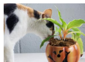
Our sweet Miss Kitty

Thank You for everyone's support from all of us at Speak Up For Horses.